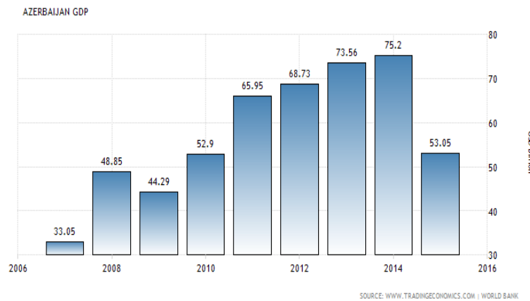
Figure 1. GDP of Azerbaijan (2005-2016), mil. USD

The increase in oil revenues led to an increase in budget expenditures. While 2005 budget expenditures were 2.1 billion manats, in 2015 were approved as 21 billion manats. So it has increased 10 times. In 2015, this figure was around 19 billion manats.